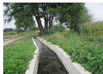
Figure 5. Irrigation channel