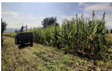
Figure 1. Crops without irrigation

The interviews were carried out through the direct interview model and the completion of the questionnaire by the authors, which allows asking for additional explanations regarding the answers to the questions. A survey was conducted to collect primary data. For quantitative data, a structured questionnaire method was used with a face-to-face interview by the authors (Figure 4), while qualitative data was also collected from interviews with questionnaires through personal discussions with farmers, such as observation of farm buildings, infrastructure inside and outside the farm, cow breeding systems, breed structure, types of feed used with a focus on silage, welfare, environment, agricultural mechanization, soil, irrigation water use systems, stable hygiene, etc. (Figures 1, 2, 3, 5, and 6).