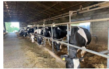
Figure 3. Feeding dairy