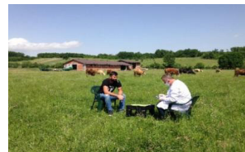
Figure 4. View from interview