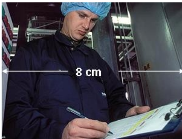
Figure 1. Taking a lubrication survey