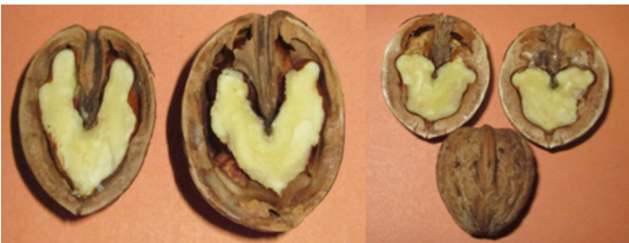
Figure 3. Walnut fruit and heart shape

There is an important false approach for people against hard shell fruits. Many people avoid consuming hard shell fruits in dread that they put on weight (Vinson and Cai, [18]). Truly, walnut has a very high value of calories. But also, walnut contains healthy fats (Sen, [14]). That's why, those who add a handful of walnut or other hard shell nuts in their diet daily keep their weight or lose a bit weight. It is scientifically proved that hard shell nuts support the brain health (Sen, [14]). The calories obtained from the hard shell nuts are not useless calories; but, the calories taken from the hard shell nuts keep the body full till the next meal. The food rich in antioxidants have positive effects on health (Tapsell et. al. , [16]; Ueshima et. al. , [17]; Ros et. al. , [12]).