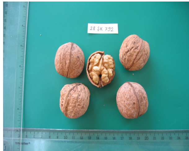
Figure 1. Anatolian walnut ( Juglans regia ).

Walnut is highly rich in terms of mono unsaturated fatty acids. Walnut is a perfect source of Omega 3 (which is essential fatty acid) and a source of arachidonic acid. Walnut has been the symbol of being enlightened since old times. The botanical structure of walnut is compared with human brain, so it is considered as the brain nutrient. Walnut is the rich source of many phyto-chemical substances (Sen, [14]). These substances which have antioxidant effects are the compounds of: melatonin, ellagic acid, vitamin E, carotenoids and polyphenols. These compounds have potential health effects against: aging, cancers, inflammations and neurologic illnesses (Sen, [15]) (Figure 1, Table 1).