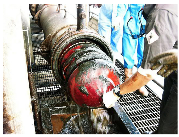
Figure 1. Oil & Gas industry pig removing debris

Figure 1 shows an Oil industry application where the pig has been used to remove debris from within a length of pipeline.