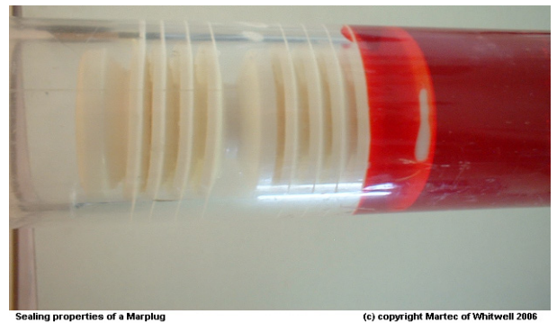
Figure 4. Sealing properties of flexible vane pig

The pig is a single moulded piece and by having several vanes a seal (Figure 4) can be maintained even across full bore branches. Creating a seal, and hence reducing the effect of bypass, has the additional impact of reducing the pressure required to propel the pig. This pressure varies depending on the viscosity of the product, the tightness of the bends and restrictions within the pipe but typically a compressed air pressure of between 2 and 4 bar is usually sufficient. With typically eight of these vanes along the device, the likelihood of the material in the pipe escaping past it is significantly reduced even when dents, flow plates, and junctions are navigated.