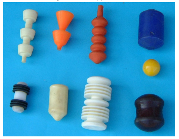
Figure 2. Example selection of pig designs

Figure 2 shows a cross section of available styles of pig used in small bore pipework (not all pigs shown are made from food grade, FDA approved materials [1]).